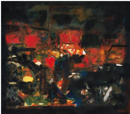
SYED HAIDER RAZA, TAPOVAN ACRYLIC ON CANVAS. PAINTED IN 1972. PRICE REALIZED: $4,452,500

SALES TOTAL USD $56,581,500 / HK$441,783,723 80% SOLD BY LOT | 87% SOLD BY VALUE