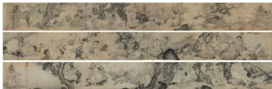
ANONYMOUS (13TH-14TH CENTURY) SIXTEEN ARHATS HANDSCROLL, INK ON PAPER PRICE REALIZED: $852,500