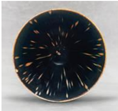
THE BERNAT DING 'PARTRIDGE FEATHER' BOWL A HIGHLY IMPORTANT DING RUSSET-SPLASHED BLACK-GLAZED CONICAL BOWL NORTHERN SONG DYNASTY PRICE REALIZED: $4,212,500

TOP LOT OF THE WEEK FOR A CHINESE WORK OF ART