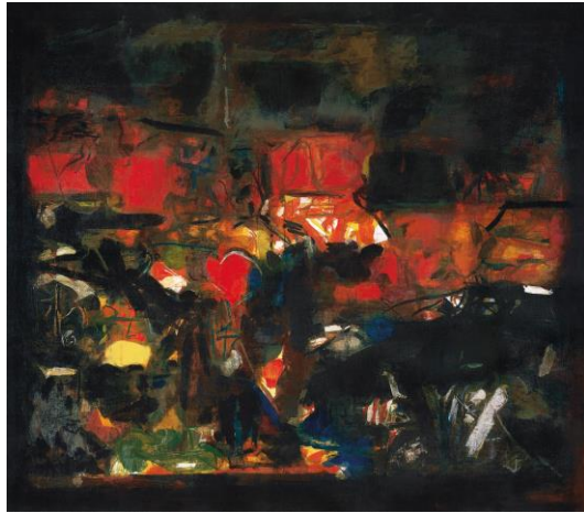
SYED HAIDER RAZA, TAPOVAN ACRYLIC ON CANVAS. PAINTED IN 1972. PRICE REALIZED: $4,452,500

WORLD AUCTION RECORD FOR A MODERN INDIAN ARTIST