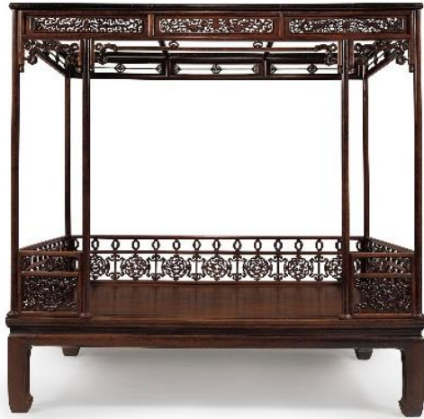
A VERY RARE HUANGHUALI SIX-POSTER CANOPY BED JIAZICHUANG 17TH-18TH CENTURY PRICE REALIZED: $1,932,500

TOP LOT OF THE WEEK FOR CHINESE FURNITURE