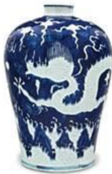
A RARE LARGE MING-STYLE BLUE AND WHITE REVERSE- DECORATED 'DRAGON' MEIPING 18TH CENTURY PRICE REALIZED: $732,500

The top lot of the sale was The Bernat Ding 'Partridge Feather' Bowl, A Highly Important Ding Russet-Splashed Black-Glazed Conical Bowl dating from the Northern Song dynasty , which realized $4,212,500 , also establishing the top lot for a Chinese work of art sold during Asian Art Week. Other notable highlights included the opening lot A Large Carved Yaozhou Bowl, Northern Song dynasty , which realized more than ten times its low estimate selling for $372,500 ; A Superb and Very Rare Carved Ding 'Peony' Dish dating to the Northern Song-Jin dynasty , which more than doubled its low estimate realizing $948,500 ; and A Very Rare and Important Painted Cizhou 'Fish' Truncated Meiping also dating from the Northern Song-Jin dynasty , which tripled the low estimate realizing $1,752,500 .