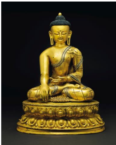
A LARGE AND IMPORTANT SILVER-INLAID GILT BRONZE FIGURE OF BUDDHA SHAKYAMUNI TIBET, CIRCA 1400 PRICE REALIZED: $3,612,500

The top lot of the sale was a masterpiece by Syed Haider Raza, Tapovan , painted in 1972 , which realized $4,452,500 , setting a new world auction record for the artist and category. Other notable results included Tyeb Mehta, Two Figures , painted in 1994 , which realized $1,812,500 ; Francis Newton Souza, The Politicians , painted in 1959 , which realized $444,500 ; and Ranjani Shettar, Remembrance from Last Night's Dream , executed in 2011 , which realized $100,000 , setting a world auction record for the artist who is currently showing an installation at the Metropolitan Museum in New York.